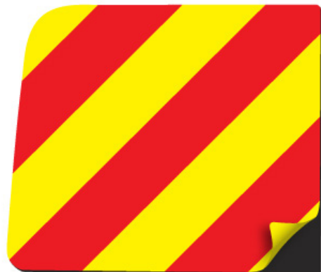
The Magnetic Chapter 8 Kit

Flooded applied kits are supplied as large sections of fluorescent panel with reflective red strips already applied. This is possibly the quickest type of kit to apply to a vehicle.