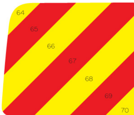
The Flooded Applied Chapter 8 Kit

Flooded separate kits are supplied to you as cut red reflective strips with large full pieces of fluorescent yellow. Simply apply a section of fluorescent yellow and then apply the appropriate strips of reflective over the top of that section.